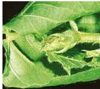
FIGURE A: Boron deficiency in cotton